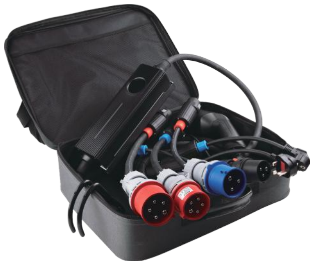
BS-PCD050 Three phase smart charger